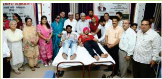
The coterie from the city encouraging blood donors on the death anniversary of Lala Jagat Narain Ji