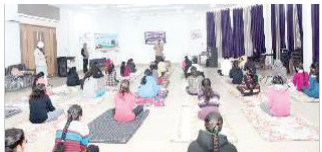
The students practising meditation during NSS camp