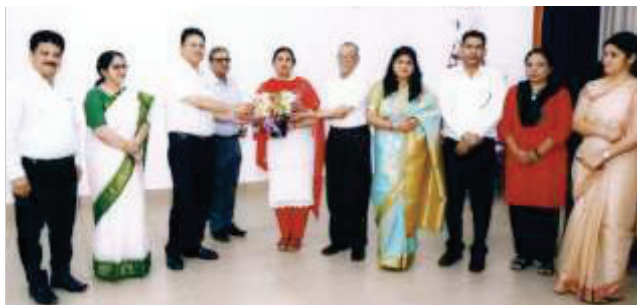
The Office bearers and principal honouring the resource person on National Seminar by Economics Department