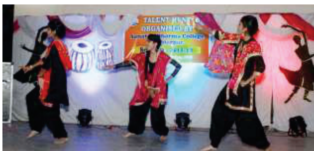
Energetic dance performance by participants in 'Talent Hunt'