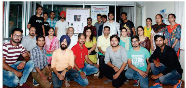
Participants of 'Regenerate : The Best Out of E-Waste' with the members of Management & Computer Society