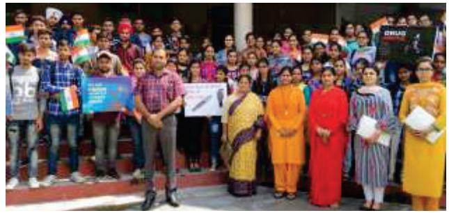
Divya Jyoti Jagriti Sansthan addressed the students against drugs