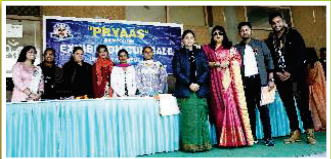
Exhibition cum Sale by college students on Alumni Meet