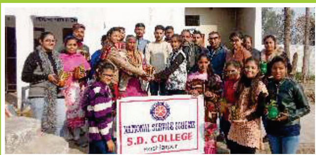
Our NSS volunteers distributing saplings in Fadma, a village adopted by college