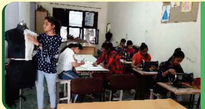
FASHION DESIGNING LAB