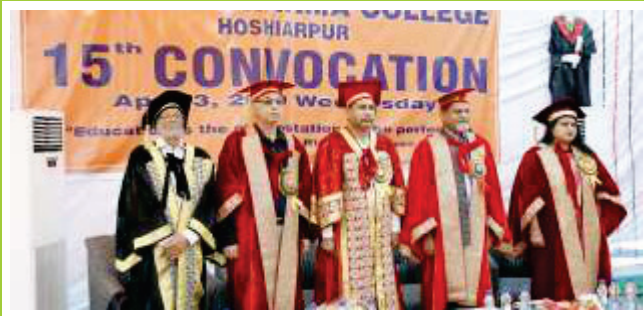
The convocation presentation team stands still during the University Anthem.