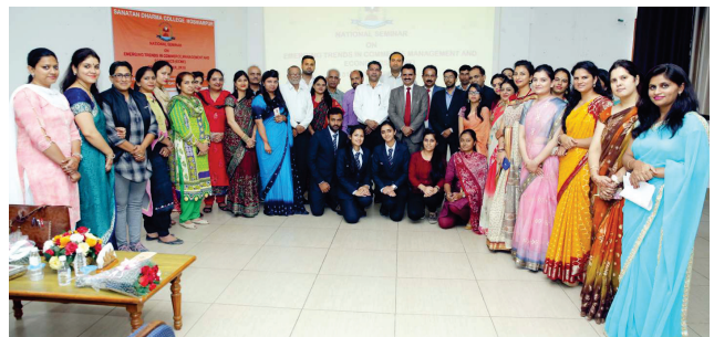
Resource persons with the Management, principal and staff during the National Seminar by Commerce Department