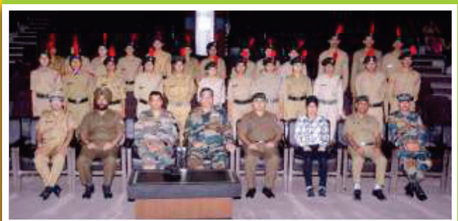
Annual Training Camp of NCC cadets at LPU, Phagwara