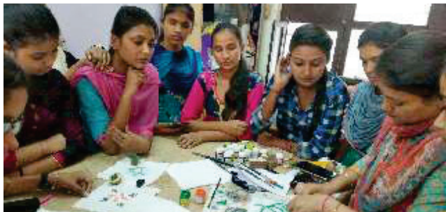
'Surface Orientation', a workshop on fabric painting by Fashion Designing Department