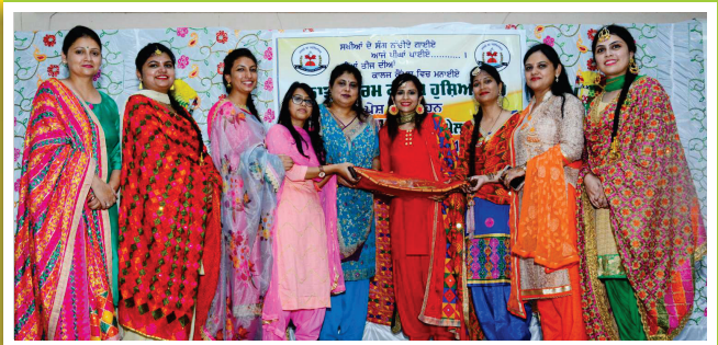
College celebrating Teej Festival