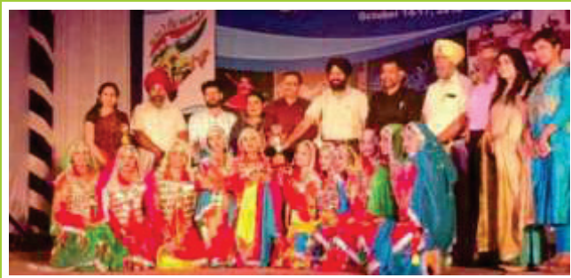
Our Luddi Team receiving first prize in Zonal Youth Festival