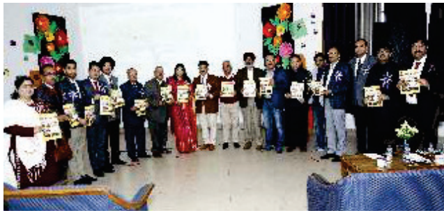
The office bearers along with the distinguished alumni releasing the College Newsletter